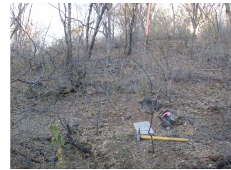
Tordillo South, in area of C and D