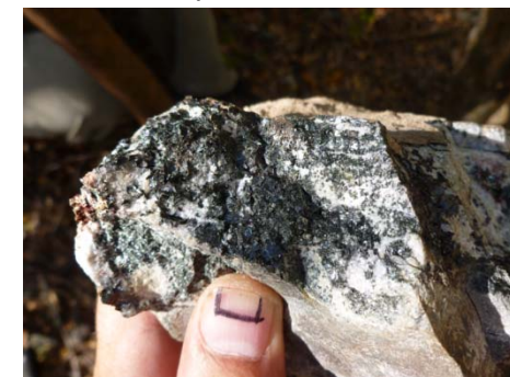
Hydrothermal Biotite, Area D